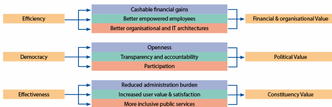
eGEP Measurement Framework Model (2006)